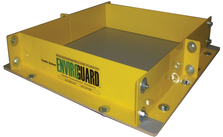
Part Number: EGS WW-LLL