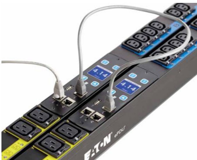
A and B power PDU sharing a network connection via daisy chain

Eaton's new patented daisy-chain capability allows up to four ePDUs to share the same network connection and IP address. Unlike competitive rack PDUs that require a dedicated IP address for best performance, Eaton technology provides a 75-percent reduction in network infrastructure costs.