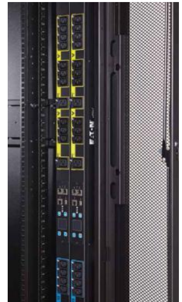
Easily mount ePDUs side-by-side in a rack