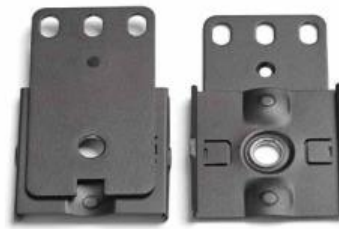
Eaton patented clip feet