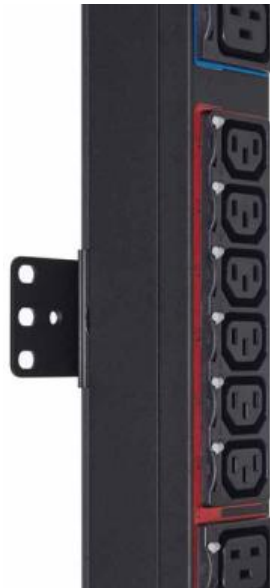
Clip feet mounted to ePDU