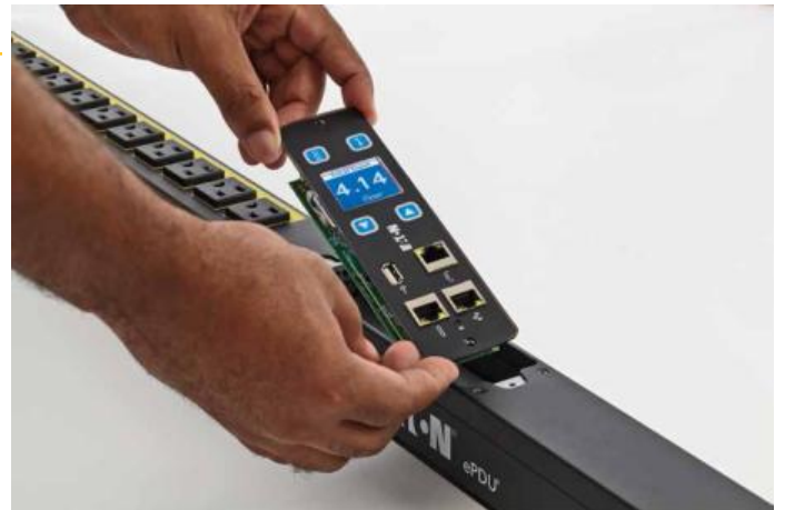
Module being removed without removing power to the ePDU

Eaton's new hot-swap eNMC (ePDU Network Management and Control) module can be replaced without the need to power down your rack. Increase uptime while enhancing serviceability and saving on unnecessary service calls. The menu-driven pixel display allows for easy setup and troubleshooting.