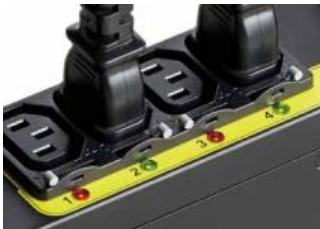
Green LED signifies power on and red is power off to outlet

Secure and protect your environment by easily turning off unused outlets. Avoid overloading your system from others plugging in unauthorized devices. Also consider closing access with an outlet cap.