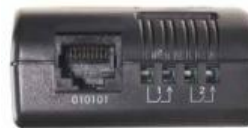
Part Number EMP001

The optional environmental monitoring probe connects to the serial port and enables you to collect temperature and humidity readings in the rack environment to monitor environmental data remotely. You can also monitor the status of two contact closure devices, such as door switches.