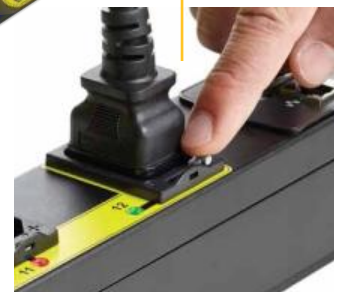
O is unlocked, + is grip engaged