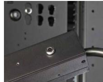
Mounting buttons come pre-installed