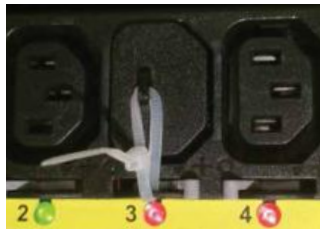
Cap secures in place with cable tie