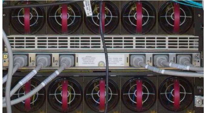
Typical server with multiple power inputs powered by two ePDUs

When connecting multiple source input servers to an A and B feed power source, the daisy-chain capability allows you to group power supplies across the ePDU. As a result, all the power supplies are controlled with a single action, which saves time rebooting servers with two to six power supplies.