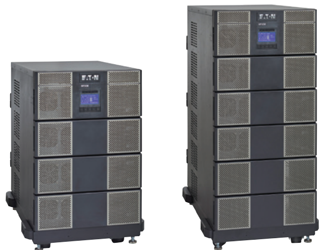
8-slot cabinet is scalable to 16 kVA in a 14U cabinet