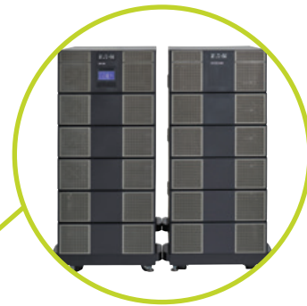
Smart EBM technology identifies batteries automatically