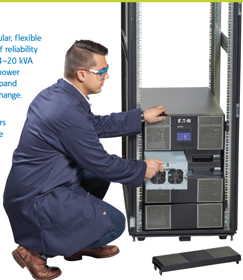
Easy hot-swappable power and battery modules

The plug-and-play power and battery modules are user replaceable so customers can add them as needed without a service call or having to put a redundant system in bypass. With its low initial investment, online double-conversion technology, Eaton ABM® technology and high efficiency mode, you never have to compromise reliability for efficiency.