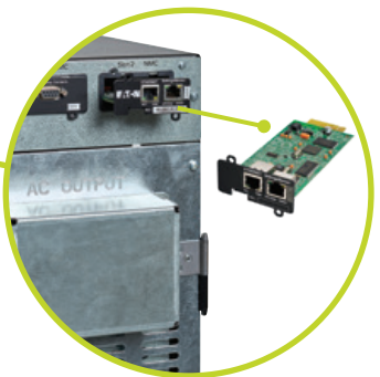
2 mini-slot ports for options using Network-MS gives access to Eaton's software offerings