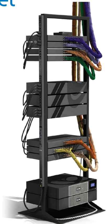
Network Closet Rack