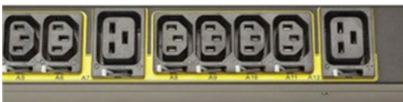
Figure 1. Rack PDUs with IEC outlet grips can reduce the risk of plugs getting bumped loose and leading to server shutdown.

In addition to cable management, power is also another component of rack hygiene, which is where UPSs and PDUs come in. To ensure maximum uptime and improve reliability, network closets should ideally contain redundant UPSs and PDUs to protect both primary and redundant equipment power supplies. However, not all network closets require fully redundant protection; by mixing and matching UPSs with PDUs, administrators can devise the right level of protection to suit their network closet needs. Typically, there are three levels of protection: