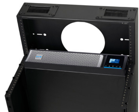
5PX G2 UPS mounted vertically in the MiniRaQ by Eaton, perfect for confined places