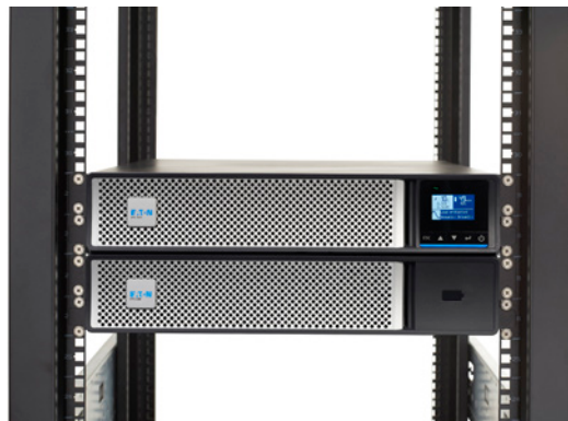
5PX G2 4-post mounting kits are rated (ISTA 3E) to support the weight of a UPS/EBM when mounted in a rack and being transported